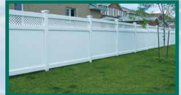
Never Sand, Paint